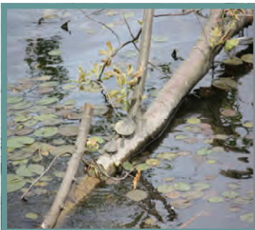
Large, woody structure (fallen trees) and colorful, native wetland plants are the finishing touches on the restored shoreline at Heritage Landing. Turtles use the trees to bask in the sun. Fish find cover and prey on