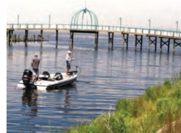
Bass Anglers at Heritage Landing Scouting for the Bass Pro Event

Institute monitored fisheries and aquatic plant beds over a 3-year period. The results have been used to measure restoration success. GVSU Seidman Business College completed a socio-economic study, revealing the project's 6-to-1 return on investment, an $11.9 million increase in housing values in neighborhoods surrounding the improved shoreline, and an increase in the value of recreation of $35.6 million over 15 years. Please contact Kathy Evans to find out more.