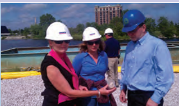
Public Involvement Tour of a Great Lakes Legacy Act Cleanup & Habitat Restoration Project

Public/Private Partnerships are needed to complete the cleanup and restoration projects currently being planned.